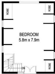
COTTAGE FIRST FLOOR