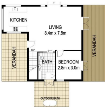
COTTAGE GROUND FLOOR

INTERNAL : 367 SQ.M. EXTERNAL: 173 SQ.M.